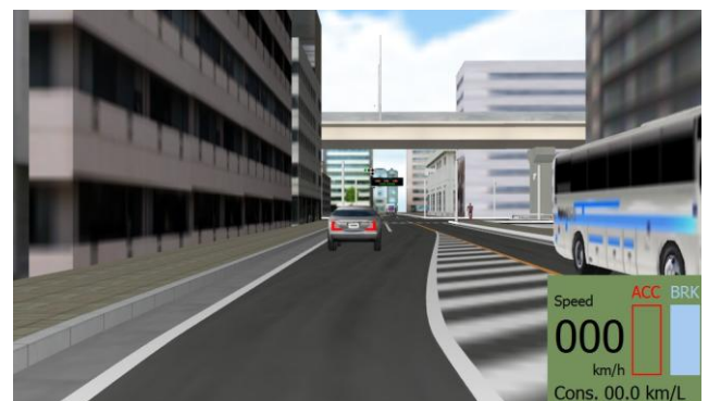
Fig.2. The drivers view at the start of the simulated drive

The simulated drive started with the drivers vehicle stationary in the left hand lane of an urban dual carriageway (start point [1]), with a 50 km/h speed restriction, on the approach to crossroads (which were situated at 0.09 km from start [2]). The driver was instructed to turn right into a triple carriageway road. The participants view from within the vehicle, at the starting point, is shown in Figure 2.