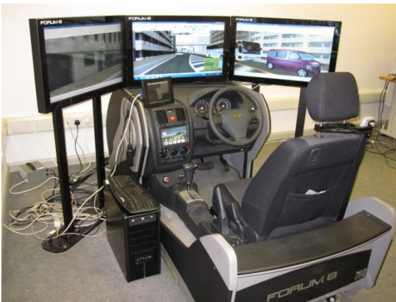
Fig.1. Forum8 driving simulator

Three scenarios requiring the driver to interact with other road users were included in the simulated drive. The first scenario occurred at cross roads, in an urban setting, during a right turn manoeuvre and involved moving and stationary opposing traffic (cars, buses and lorries). The next scenario involved an opposing motorcycle passing through the junction. This was followed by a child on a bicycle crossing the road into which the driver was turning, as the driver turned right at the cross roads. The final scenario involved heavy traffic flow (cars and lorries) travelling in the same direction as the driver during a merge manoeuvre on a dual carriageway road.