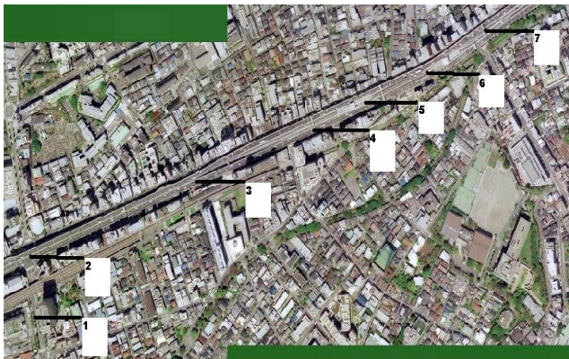
Fig.3. Plan view of the route and surrounding environment

various road user scenarios, turning right when safe to do so. Upon turning right the driver had to get over to the far right hand lane so that they could exit the triple lane carriageway via a single lane slip road on the right of the carriageway (situated at 0.25 km from start [3]). The slip road followed a steep incline then levelled out (at 0.55 km from start [4]) onto a short dual carriageway strip of road in which the left hand lane was closed with a series of cones. The driver was then faced with two toll booths (at 0.74 km from start [5]) and instructed to go through the one on the right hand side. Upon approach the toll booth barrier opened to allow the driver to pass. Shortly after the toll booth the driver was required to merge with heavy traffic to join a dual carriageway on the left. The dual carriageway continued until reaching a fork in the road (at 1.15 km from start [6]). At the fork, the driver was required to branch left and drive for a short distance before a sign appeared on the screen signifying the end of the simulated drive (at 1.23 km from start [7]).